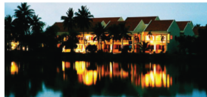
Enjoy Indochina's most stylish accommodations

This morning, visit the ancient Citadel and the Forbidden Purple City, once the seat of Vietnam's emperors. For this tour we'll be accompanied by the Director of the Hué Restoration Committee. Next, drive south past fishing villages and rice fields set between the rugged Annamese mountains and the Gulf of Tonkin. Stops en route include Danang's Cham Museum, to view a collection of artifacts from the former Hindu kingdom of Champa, and a short visit to China Beach, the famed R&R site for US soldiers.