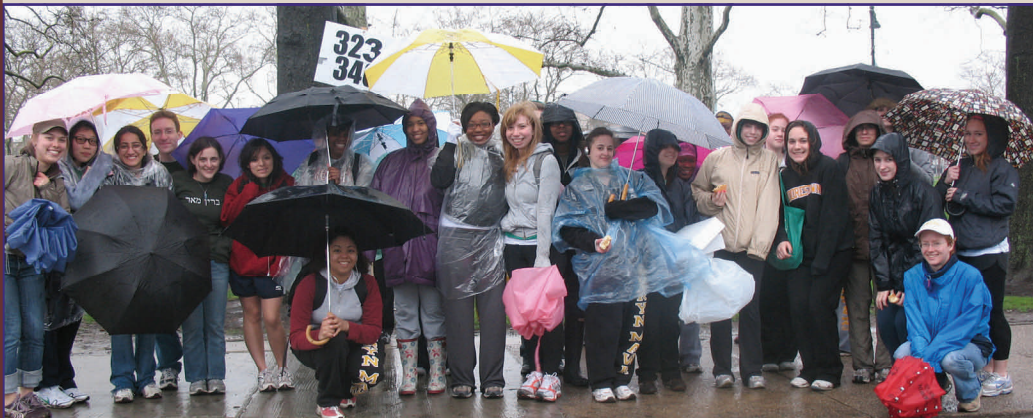
Bryn Mawr College participants at the 2009 Walk Against Hunger, Philadelphia, PA