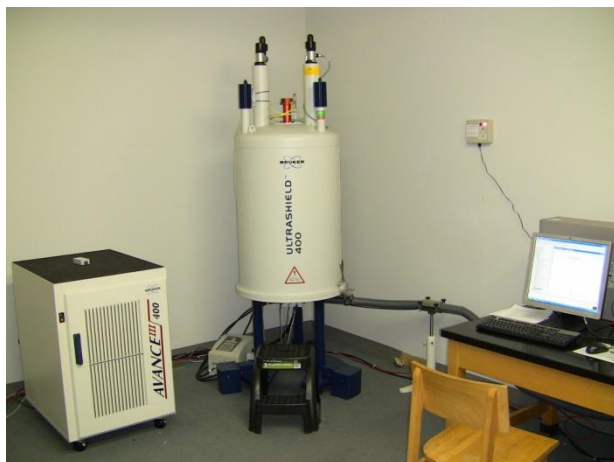
The Chemistry Department's Bruker 400 MHz NMR Spectrometer