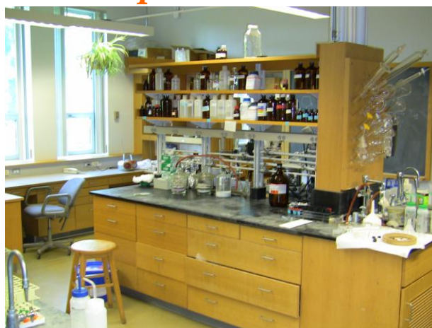
Malachowski Group lab facilities