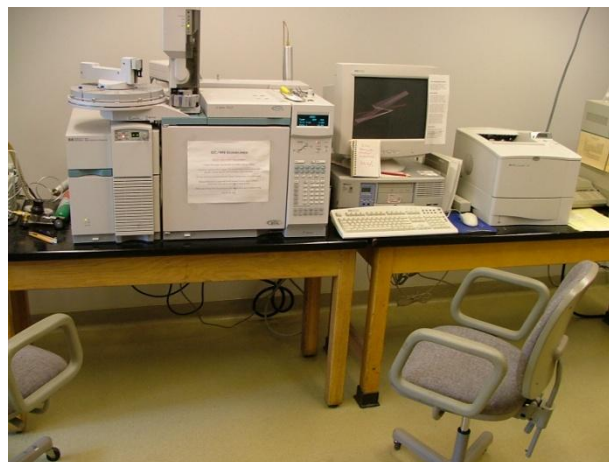
The Chemistry Department's Agilent GC-MS