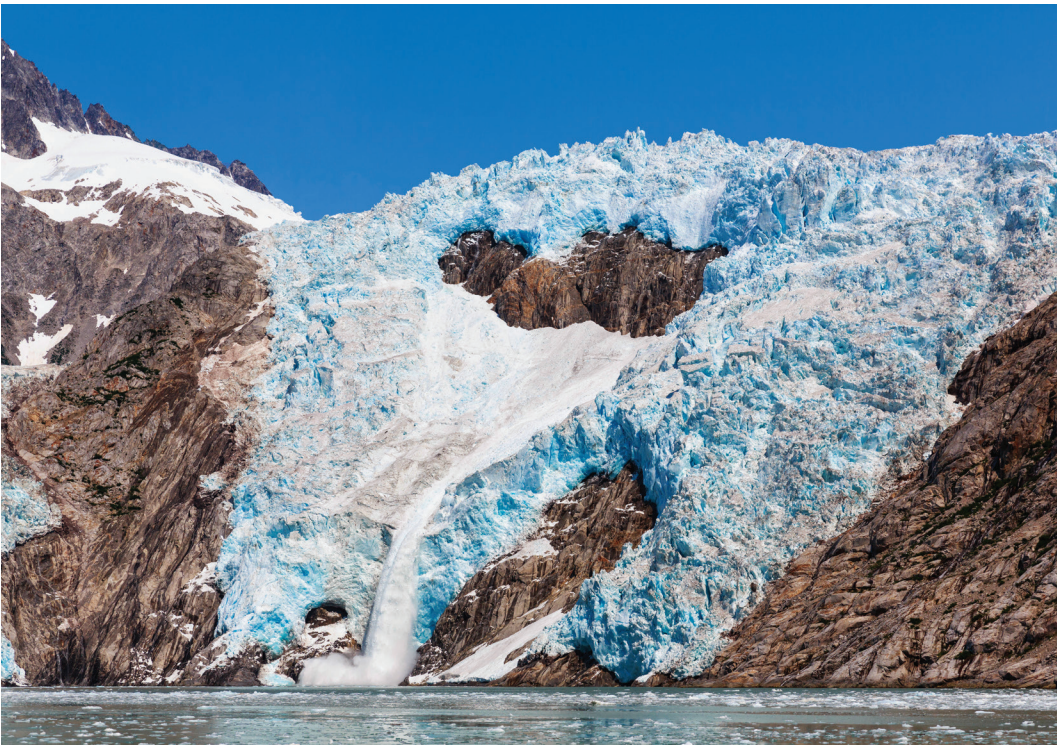
We see glaciers, wildlife, and marine life on a cruise to explore rugged Kenai Fjords National Park on Day 9.

world, the grueling Iditarod draws nearly 100 mushers and their dog teams annually. Here we learn about the history of the race and meet the kennel's Husky puppies. We return to the lodge for lunch followed by an afternoon at leisure, perhaps to do some hiking or take an optional rafting excursion. This evening we reconvene for dinner and a lively show at the Denali Dinner Theater. B,D