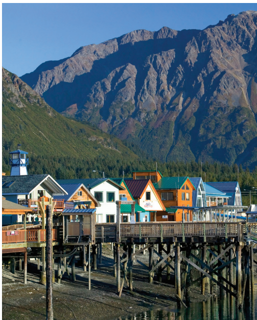
Colorful buildings overlook Seward’s harbor.

the city. Tonight, we celebrate our journey through Alaska at a farewell dinner. B,D