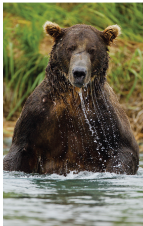
Taking a dip ...

Day 9: Seward One of Alaska’s most scenic communities, Seward features a bustling harbor, inviting shops, and plenty of outdoor activities. The city also serves as the gateway to Kenai Fjords National Park, a 600,000-acre preserve comprising long fjords, primeval glaciers, and tranquil bays and coves. We explore this rugged park today on a glacier and wildlife cruise. On board, we get up close