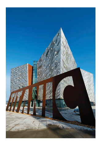
Titanic Museum, optional extension

Day 11: Kilkenny Today is devoted to Kilkenny, a well-preserved medieval city known as Ireland's cultural capital – and the country's smallest city. We tour 12<sup>th</sup>-century Kilkenny Castle, considered one of the country's most beautiful, then embark on an informal walking