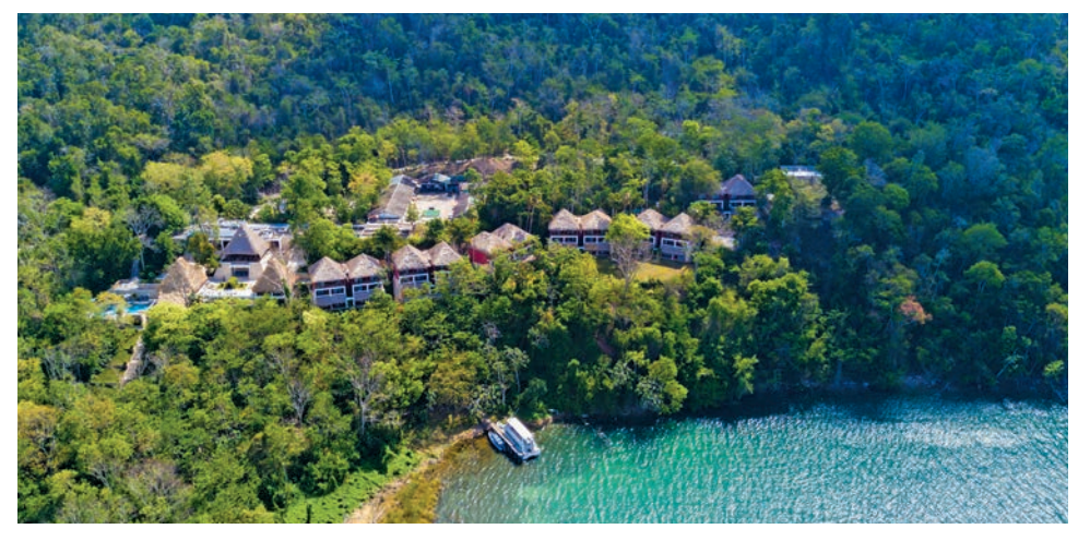
Opposite page (clockwise from top): Gartered trogon; sunrise and morning mist at Tikal; Temple 1 in Tikal; explore the little-visited Maya ruins at Yaxhá; white-nosed coati in Tikal National Park. This page: Lush rain forest surrounds temple pyramid, Tikal; aerial view of the Hotel Camino Real Tikal.

Spend three nights at the beautiful Hotel Camino Real Tikal, your home base while you explore the Maya culture and ruins. The hotel is nestled in the rainforest, where you can enjoy the many different species of birds while on an optional bird walk with your naturalist or relax on a sunset boat ride on Lake Petén Itzá