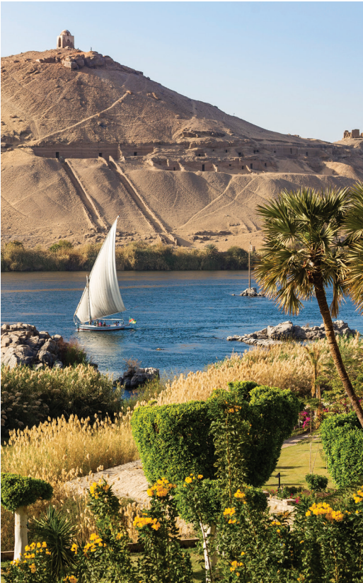
We sail traditional feluccas along the Nile.

Day 15: Depart for U.S. Very early this morning we transfer to the airport for our return flight to the U.S. B