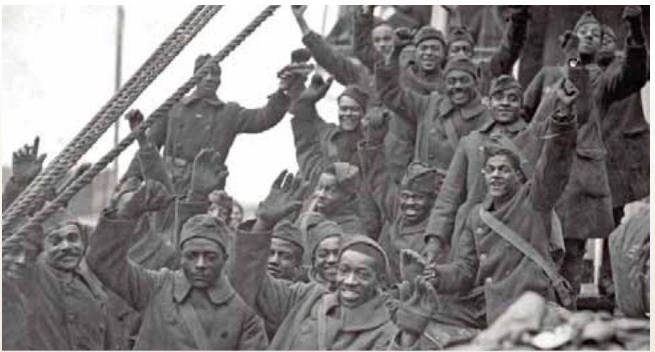
369th Infantry Regiment