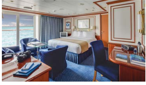
Category 6 cabin.

All cabins and suites feature ocean views, private facilities, climate controls, and a flat-screen TV. Equipped with Ethernet and Wi-Fi connections and USB ports for mobile devices. Some cabins have French balconies. Botanically inspired shampoo, conditioner,