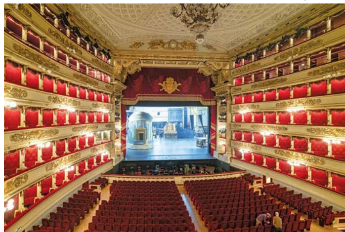
Teatro alla Scala, Milan

On a private boat ride on Lake Maggiore, sail past islands with beautiful villas, graced with natural beauty. Visit the crown jewel of the Borromean archipelago,