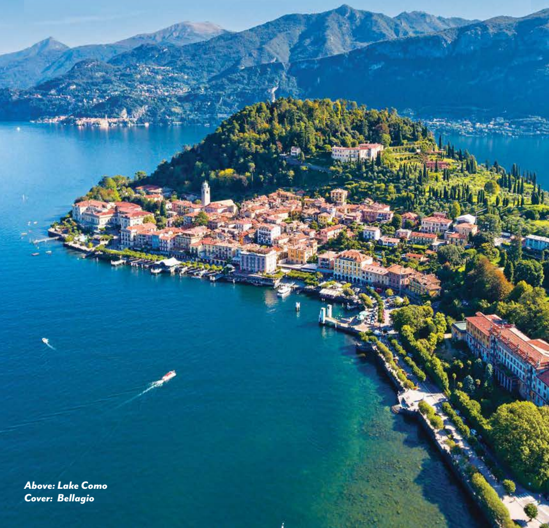
Above: Lake Como Cover: Bellagio