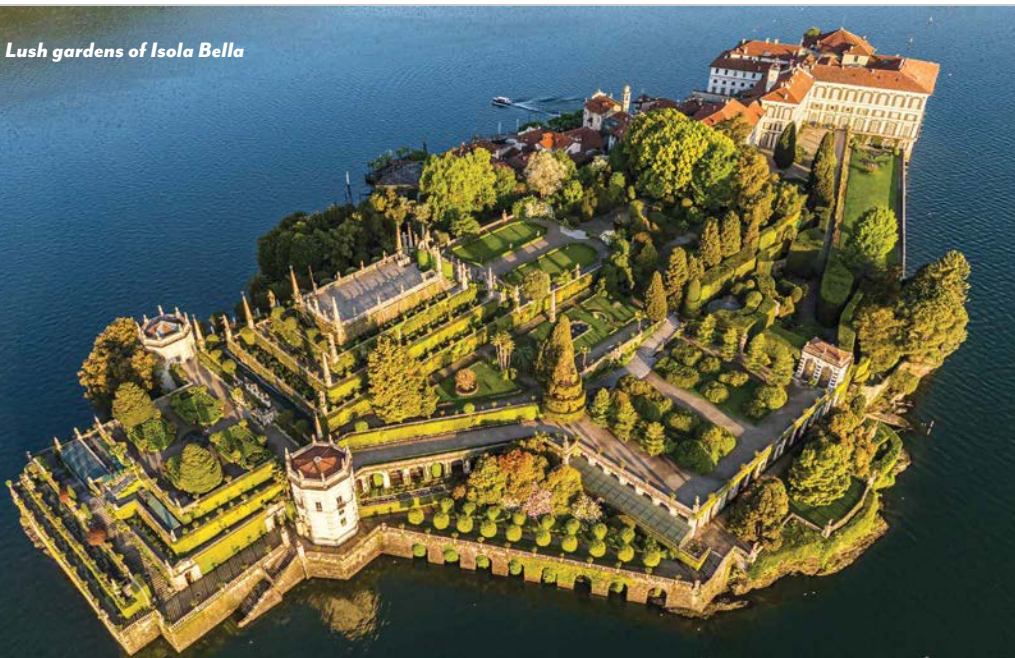
Lush gardens of Isola Bella

Como, Italy's deepest and perhaps most spectacular lake, while learning about its fascinating history and allure. Visit the magnificent Villa del Balbianello, which you may recognize from "Casino Royale" and other films. Unique terraced gardens surround the villa, where holm oaks — evergreens native to the Mediterranean — are pruned into a distinctive umbrella shape.