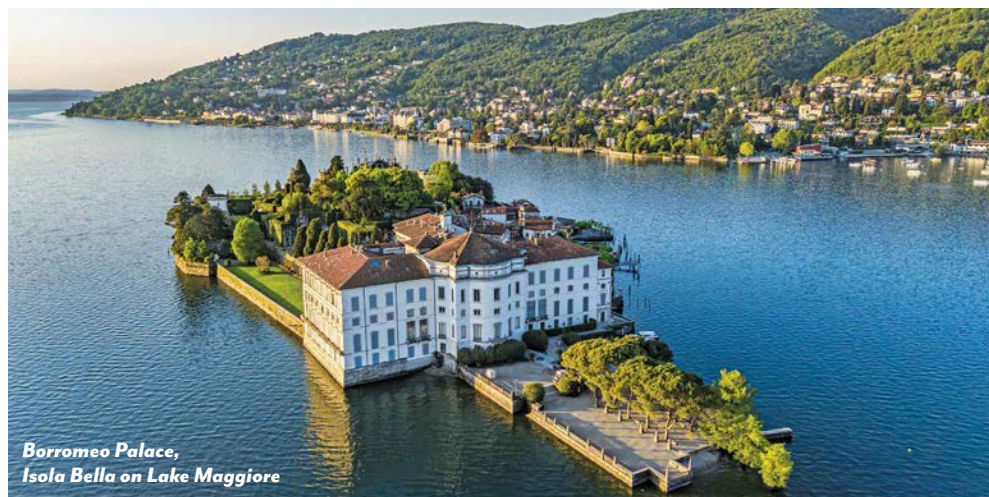
Borromeo Palace, Isola Bella on Lake Maggiore