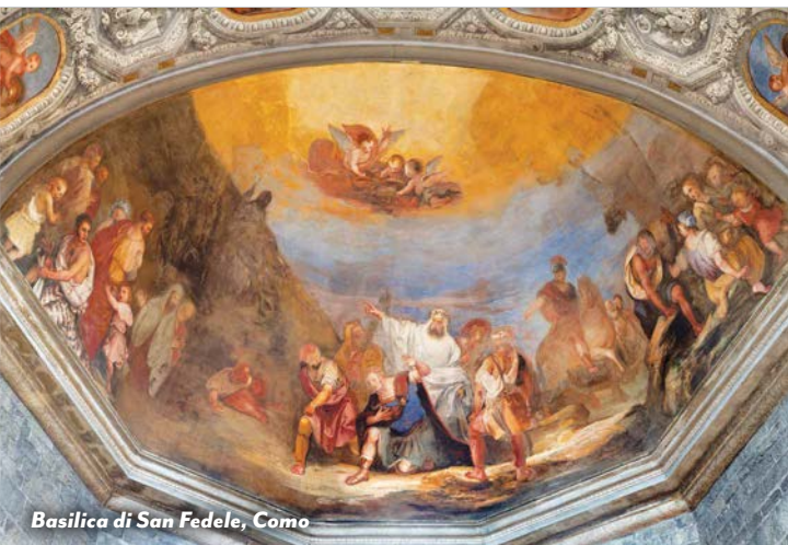
Basilica di San Fedele, Como