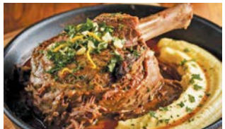
Osso Buco, a Lombardy specialty