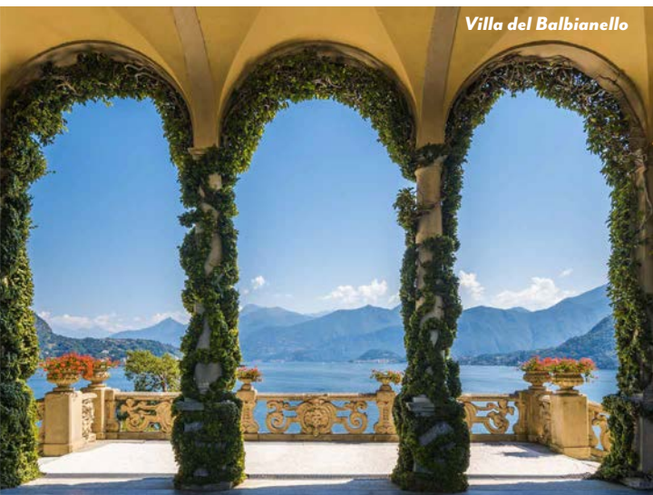
Villa del Balbianello